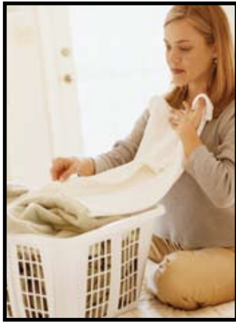
In the laundry . . .