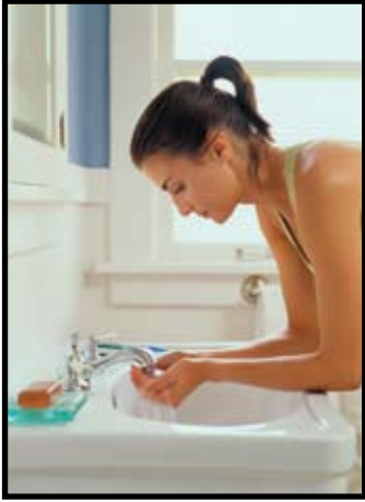
In the bathroom . . .

Enjoy Softened Water Throughout Your Home