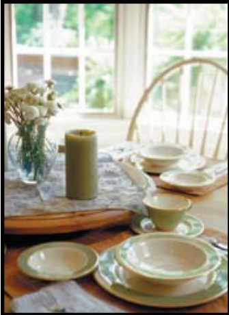
In the kitchen . . .